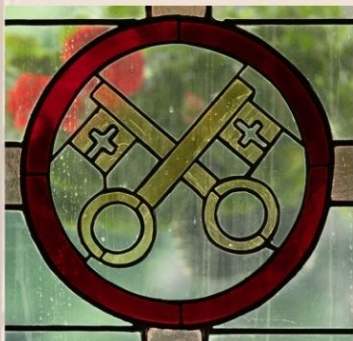
Video about Frank Richichi's amazing windows

Richichi Stained-Glass Window Pilgrimage, continued