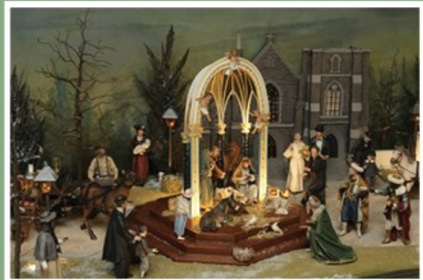
"December 24, 1882: The Nativity at St. Mary's Church"

Following the tour there will be a group lunch at a local restaurant.