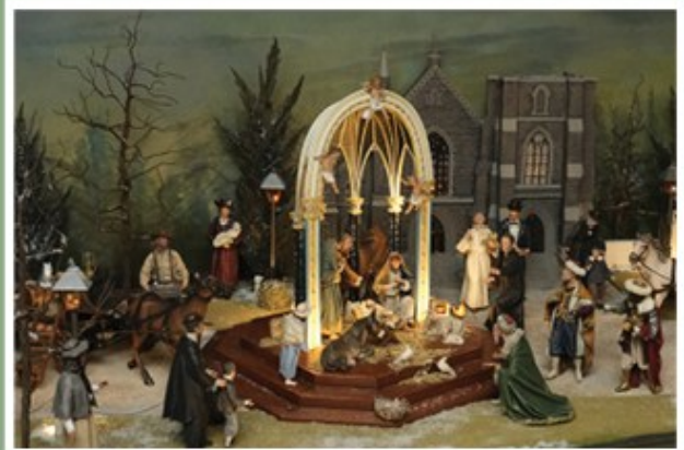
"December 24, 1882: The Nativity at St. Mary's Church"

Following the tour there will be a group lunch at a local restaurant.