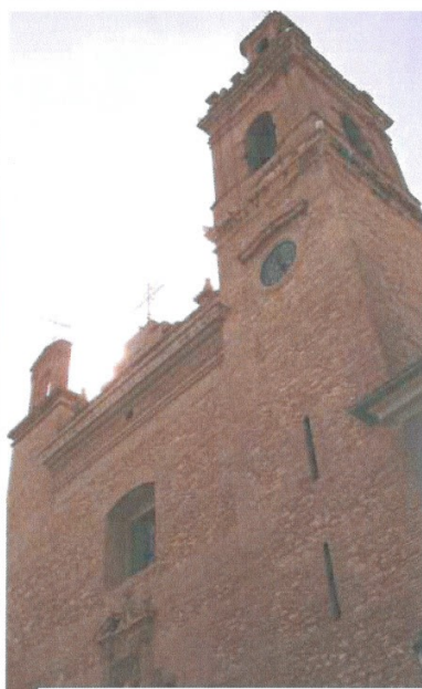
Our Lady of the Angels, Silla