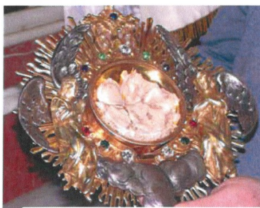
Hosts of the Miracle

The Eucharistic miracle of Silla happened in 1907. Some Hosts, stolen by unknown thieves, were recovered in perfect condition, hidden under a stone in a little garden not far from the city. Even today it is possible to adore the miraculous Hosts: they remain intact since almost one hundred years ago. The Hosts are preserved in the church of Our Lady of the Angels, in Silla. Still today it is possible to adore the uncorrupted Host preserved in the church of this town at the outskirts of Valencia.