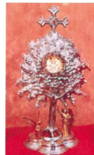
I CENTENARIO DE LAS SAGRADAS FORMAS INCORRUPTAS SILLA 1907-2007