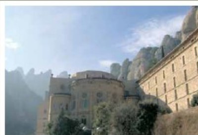
Sanctuary of the Madonna of Montserrat