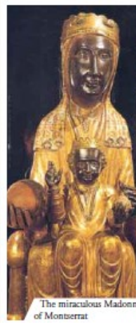
The miraculous Madonna of Montserrat