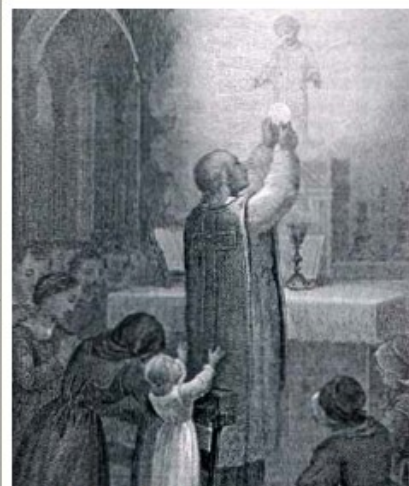
Ancient print of the miracle