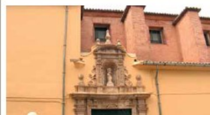
The church where the miracle took place