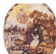
Inés in the cave where she lived as a hermit