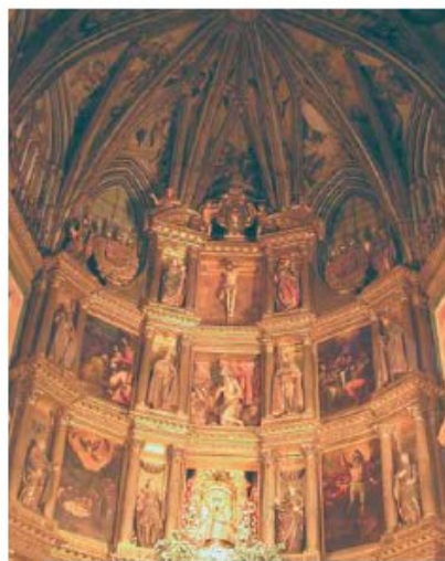
Retable of the Madonna of Guadalupe