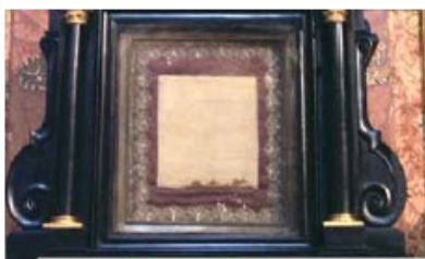
Relic of the Blood-stained corporal