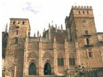
Church of Nuestra Señora of Guadalupe

Even today, in the sanctuary of Guadalupe, it is possible to admire the precious relics of the Corporal and of the bloodied pall (the pall is the small rigid linen cloth, of square shape, that serves to cover the chalice and the patent), used during the miraculous Mass from the Venerable Don Pedro Cabañuelas, in the region of Toledo. He was always distinguished for his deep devotion to the Holy Eucharist, and he spent many hours in adoration both night and day before the Blessed Sacrament. He had been brutally tempted to doubt about the reality of transubstantiation, but in 1420 all of his doubts had disappeared. As he had been accustomed to do daily, Don Pedro began to celebrate the Holy Mass: at the moment of the consecration he saw a dense cloud to come down from above and settle itself above the altar. He could not see anymore.