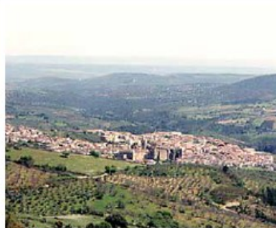
View of Guadalupe