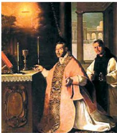
Francisco de Zurbarán, re-creation of the miracle

During the celebration of the Mass, a priest saw numerous drops of Blood fall from the consecrated Host. The miracle contributed to strengthening the belief of the priest and many of the faithful, among whom was also the King of Castile. There are numerous documents that testify to the miracle. The relics of the marvel had been exhibited to the veneration of the faithful during the Eucharistic Congress of Toledo in 1926 and even today are the objects of deep devotion to the whole of the Spanish people.