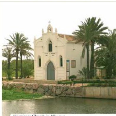
Hermitage Church in Alboraya