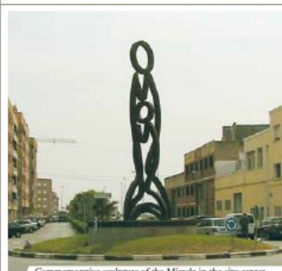
Commemorative sculpture of the Miracle in the city-center