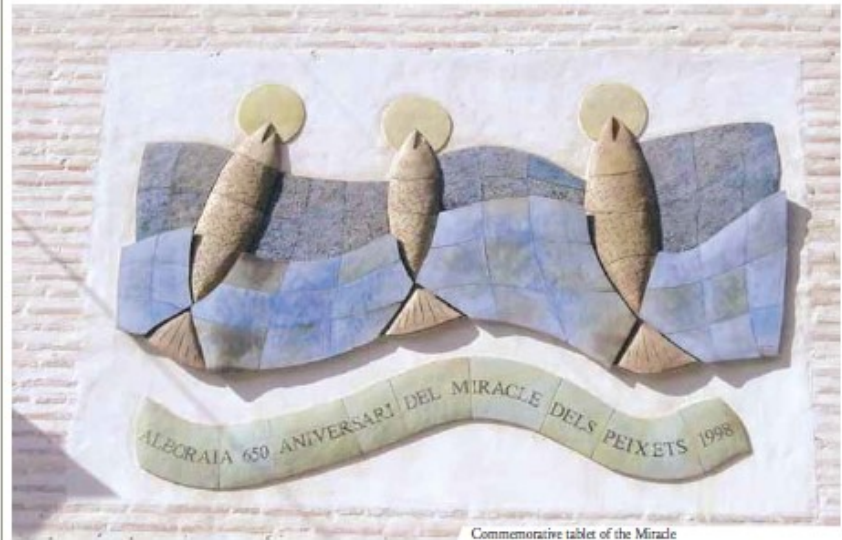
Commemorative tablets of the Miracle

Great was his joy when he saw that the three prodigious fish were there, almost completely out of the water, lifting the Hosts, intact, with their mouths, like little trophies.