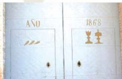
The fish in the Miracle are represented on door of the entrance to the Church