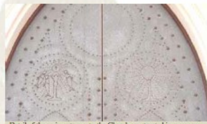
Detail of the main entrance to the Church constructed in memory of the Miracle