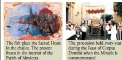
The fish place the Sacred Hosts in the chalice. The present fresco in the interior of the Parish of Almácer