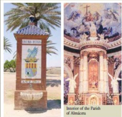
Interior of the Parish of Almácer