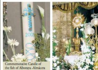
Commemorative Candle of the fish of Alboraya-Almácer