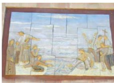
Mosaic on the exterior of the Church