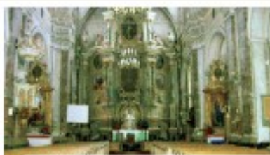
Interior of the Sanctuary

In 1290, due to the invasion of the Lithuanians, a priest from the village of Glotowo buried in a field a silver ciborium plated in gold, with a consecrated Host still in it which he missed by mistake. The Lithuanian's troops destroyed the village and the church. None of the survivors knew about the hidden Host. Only a number of years later, while plowing the field in the spring, a farmer found it by chance, thanks to the strange behavior of his oxen. They had bowed to the ground in adoration of the Host which was emanating a very bright light.