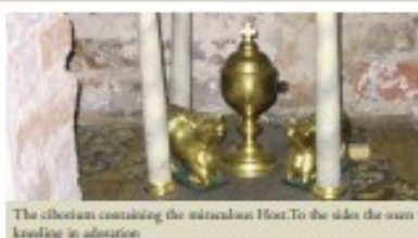
The ciborium containing the miraculous Host. To the sides the oxen kneeling in adoration.