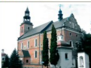
The Eucharistic Sanctuary of Glotowo