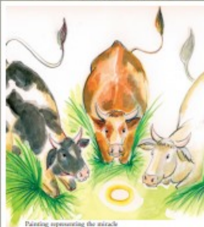
Painting representing the miracle

The most ancient documents describe how the miracle happened. The oxen were pulling the plow, behind which the farmer was walking. The sun was setting at the horizon, creating long shadows. The man lifted his eyes and prodded the animals which were going slowly up the hill. All of sudden, the plow got stuck, the oxen pulled harder and on the side they turned over a big clod of earth.