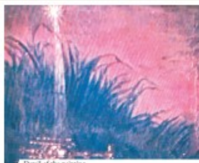
Detail of the painting