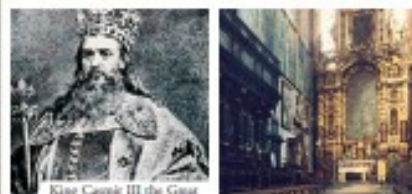
King Casimir III the Great