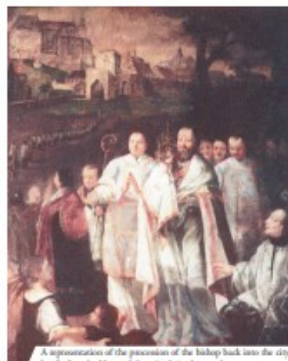
A reproduction of the procession of the bishop back into the city after finding the Hosts of the miracle in the marsh

spot where the treasure had been abandoned. Bright flashes of light were visible for several kilometers. Frightened villagers approached the area and reported back to the Bishop of Krakow. The bishop called for three days of fasting and prayer. On the third day, he led a procession out to the marsh. There, they found the monstrance, and within it they found the Hosts, which were unbroken and were the source of the unusual lights. The people began to pray and to celebrate the miracle. Annually on the occasion of the feast of Corpus Christi, the miracle is celebrated in the church of Corpus Christi in Krakow.