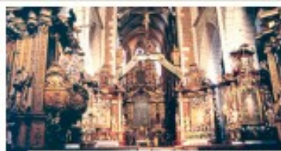
Inside of the Corpus Christi Church, Krakow