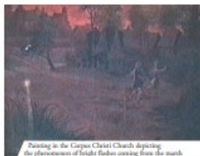
Painting in the Corpus Christi Church depicting the phenomenon of bright flashes coming from the marsh

The Eucharistic miracle of Krakow relates to consecrated Hosts that emitted an unusual bright light when they were hidden by thieves in a muddy marsh. The thieves had stolen a monstrance containing consecrated Hosts from a church in the village of Wawel (outside of modern-day Krakow). They ultimately abandoned the monstrance and Hosts in a marsh outside of the village, where the miracle took place. The Church of Corpus Christi in Krakow, Poland contains paintings depicting the miracle as well as documents and depositions relating to the matter.