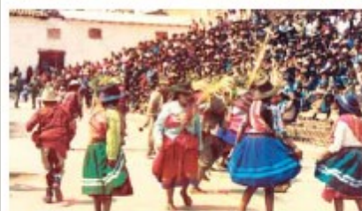
Celebrations in honor of the Divine Child