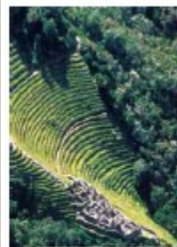
Ancient terraces, Peru