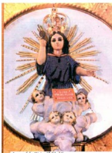
Image of the Divine Child of Eten

The Eucharistic Miracle of Eten happened about 365 years ago in the Peruvian town of Port Eten. In a Host exposed for public adoration, there appeared the Child Jesus and three interconnected hearts of a brilliant white color. Every year, the feast in honor of this event begins on July 12, with the transfer of the Host of the Miracle from its Sanctuary to the church in the City of Eten, and it ends on July 24.