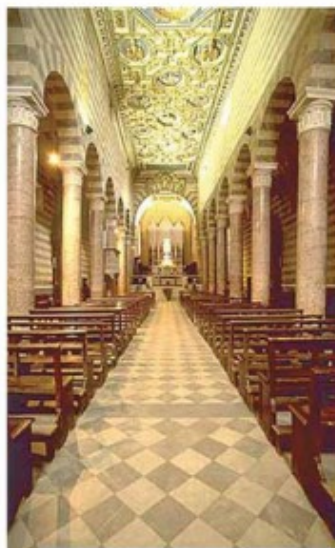
Interior of the Cathedral

In 1472, during the war that broke between Volterra and Florence, a soldier from Florence, having entered in the Cathedral of Volterra, managed to take possession of the precious Ciborium of ivory which contained numerous consecrated Hosts. As soon as he left the Church, taken by a fit of fury against the sacramental Jesus, he threw the ciborium with its precious content against a Church wall. From it, came out all the Hosts, which - illuminated by a mysterious light - elevated themselves in the air and remained suspended for a long time. Many are the witnesses that were present at the event.