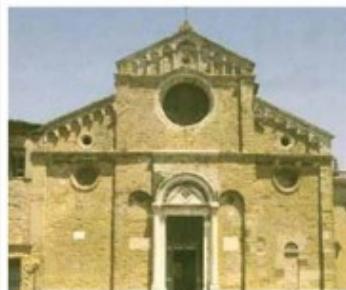
Church of Saint Francis

Church of Saint Francis. We also have some municipal acts preserved in the municipal library of Volterra. A soldier from Florence entered the Cathedral Church and immediately went to the tabernacle, from which he took the ciborium with consecrated Hosts inside, along with many sacred objects. As soon as he left the Church, taken by a very strong hatred against Jesus the Eucharist, flung the ciborium against one of the external walls of the Church, and all the Hosts came out from it, which - as if held by an invisible hand - elevated themselves in the air, all radiant with light. The soldier fell to the ground out of fright, and having repented, began to cry. Many were the witnesses who were present at this marvel.