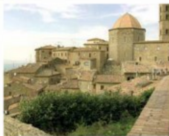
View of Volterra