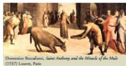
Domenico Beccafumi, Saint Anthony and the Miracle of the Mule (1537) Louvre, Paris