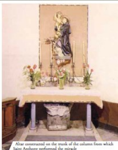
Altar constructed on the trunk of the column from which Saint Anthony performed the miracle