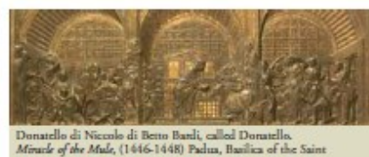
Donatello di Nicolo di Betto Bardi, called Donatello, Miracle of the Mule , (1416-1448) Padua, Basilica of the Saint