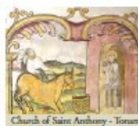
Church of Saint Anthony - Toros