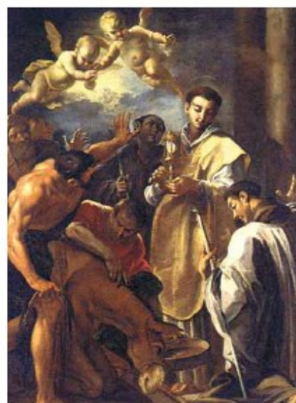
Miracle of Saint Anthony, Collection of the Diocesan Museum of Milan

In Rimini, it is still possible today to visit the church that was built in honor of the Eucharistic miracle performed by Saint Anthony of Padua in 1227. This episode is also cited in "Begninitas," considered one of the most ancient sources regarding the life of Saint Anthony. "This saintly man was speaking with a faithless heretic who was opposed to the sacrament of the Eucharist and whom the saint had nearly led to the Catholic faith. But, after numerous arguments, this heretic declared: 'If you, Anthony, produce a miracle and demonstrate to me that the Body of Christ is truly in Communion, I will completely renounce my heresy and immediately convert to the Catholic faith. Why don't we have a wager? I'll keep one of my beasts locked up for three days to feel the torments of hunger. Then I will bring it forth in public and show it food. You