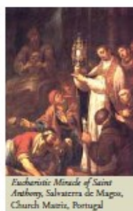
Eucharistic Miracle of Saint Anthony, Salvaerra de Magoa, Church Maria, Portugal