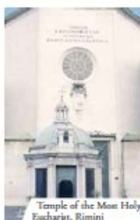
Temple of the Most Holy Eucharist, Rimini