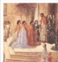
Fresco in the basilica depicting the first miracle that took place in 1230, showing the priest Ugucione carrying the Blood in procession