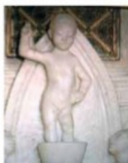
Details of the tabernacle where the reliquaries of the two Eucharistic miracles are stored