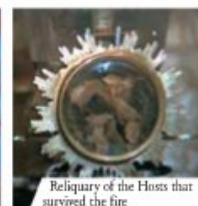
Reliquary of the Hosts that survived the fire