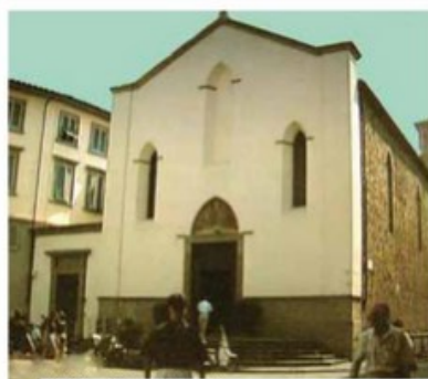
Basilica of Saint Ambrose, Florence

The reliquaries of two Eucharistic miracles which took place in 1230 and 1595 are held in Florence's Church of Saint Ambrose. In the 1230 miracle, a distracted priest left several drops of consecrated wine in the chalice after Mass. The next day, returning to celebrate Mass in the same church, he found in the chalice drops of living Blood coagulated and incarnated. The Blood was immediately kept in a crystal cruet. The other Eucharistic miracle took place on Good Friday in 1595, when several fragments of the Host were miraculously unharmed in a church fire.