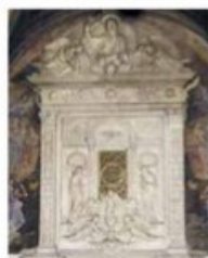
Precious tabernacle, done by Mino da Fiesole, where the reliquaries of the two miracles are kept