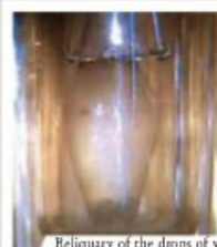
Reliquary of the drops of wine transformed into living Blood