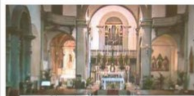
Interior of the Basilica of Saint Ambrose