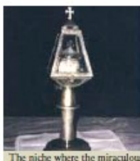
The niche where the miraculous

On the night of July 25, 1969, some thieves broke into the parish church of San Mauro la Bruca with the intention of stealing some of the more precious objects. After they had pried open the tabernacle, they took a ciborium containing many consecrated Hosts. Once they left the church, the thieves emptied the ciborium and threw the Hosts on a footpath. On the following morning, a child noticed the pile of Hosts at the intersection of the road and gathering them up, he immediately gave them to the pastor. It was only in 1994, after 25 years of detailed analysis, that Msgr. Biagio D'Agostino, Bishop of Vallo della Lucania, acknowledged the miraculous preservation of the Hosts and authorized the cult. The conclusion of any chemical and scientific analysis acknowledges that after just 6 months wheat flour severely deteriorates and in a few years turns gelatinous and then, finally, to dust.