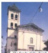
The facade of the church