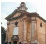
The chapel from which the Blessed Sacrament was taken. The stone tablet describes the miracle