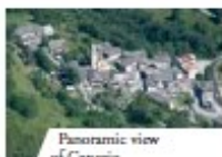
Panoramic view of Canosio