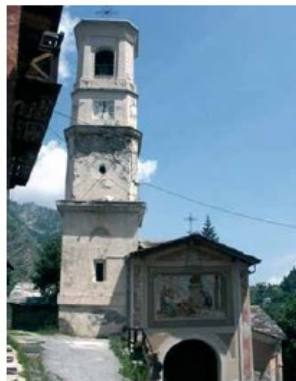
Parish Church of Canosio

Canosio is a small village in the region of Val Maira, in the Diocese of Saluzzo. In 1630, its townspeople had grown cold in their religious observance due to the spread of the Calvinistic heresy. A day after the feast of Corpus Christi, the river at Maira flooded because of a torrential rainfall. The flood waters were so violent and powerful that some massive stones were dislodged from the mountain and threatened to destroy the valley and the village itself!