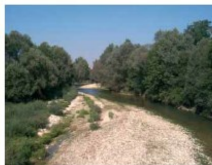
The Maira River