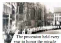
The procession held every year to honor the miracle