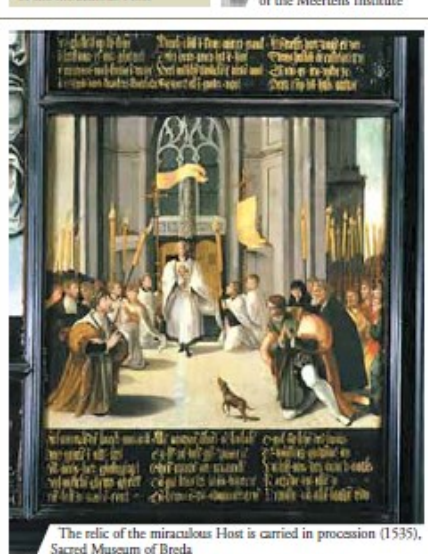
The relic of the miraculous Host is carried in procession (1535), Sacred Museum of Breda