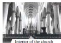
Interior of the church