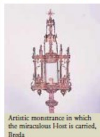
Artistic monstrance in which the miraculous Host is carried, Breda