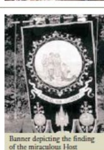
Banner depicting the finding of the miraculous Host