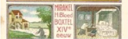
The Eucharistic miracle took place at St. Peter's Church in Boxel