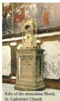
Relic of the miraculous Blood, St. Catherine's Church