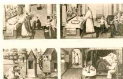
Ancient depictions of the miracle