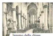
Interno della chiesa