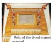
Relic of the blood-stained corporal