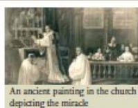
An ancient painting in the church depicting the miracle