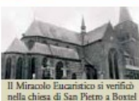
Il Miracolo Eucaristico si verificò nella chiesa di San Pietro a Boxel