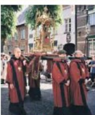
The relic being carried in procession