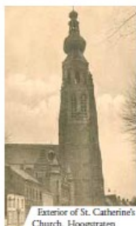
Exterior of St. Catherine's Church, Hoogstraten