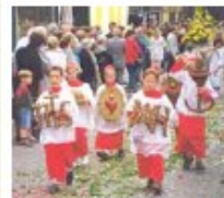
Procession in honor of the miracle

and paintings. Popes Clement XI, Benedict XIV, Pius IX and Leo XIII all showed a particular devotion to the miracle.