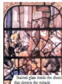
Stained glass inside the church that depicts the miracle