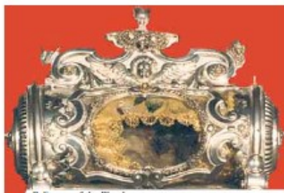
Reliquary of the Blood