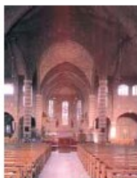
Interior of the church