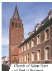
Church of Saints Peter and Paul at Boxmeer

During a Mass in Boxmeer, in Holland, in the year 1400, the species of wine was transformed into Blood and bubbled out of the chalice, splashing onto the corporal. As soon as the priest, terrorized at the sight, asked God to forgive his doubts, the Blood stopped bubbling out of the chalice. The Blood that had fallen on the corporal coagulated into a lump the size of a walnut. Even today one can see the Blood, which it has not changed at all over time.