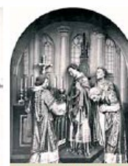
Painting inside the church that depicts the miracle