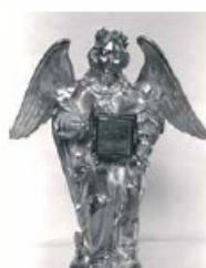
Reliquary that contains the blood of the miracle