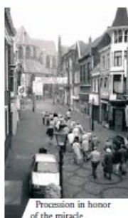
Procession in honor of the miracle