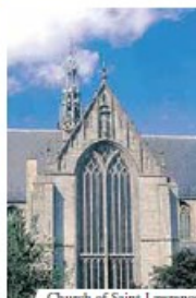
Church of Saint Lawrence