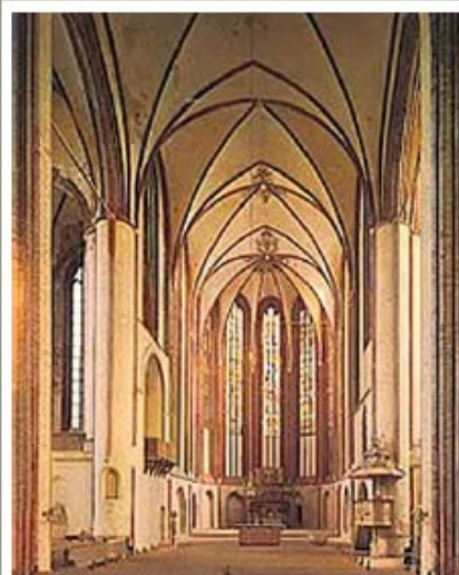
Interior of the Church

was added offerings by the Archbishop of Magdeburg, and of the Bishops of Brandenburg, Havelberg, and Lebus. Until the 1500s, Wilsnack became one of the most important places of pilgrimage in Europe. Thanks to numerous offerings left by pilgrims who came to venerate the miraculous Hosts, it was possible to finance the construction of the enormous Church of St. Nikolai, dedicated to the Miracle. Even today the church offers one of the most important examples of the gothic style in fired brick typical of northern Germany. The monstrance containing the relics of the three Hosts was destroyed in the fire of 1522. However, numerous written testimonials about the miracle and works of art depicting it survive.