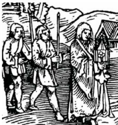
Antique prints depicting the phases of the Miracle

During a terrible fire that exploded in the village of Wilsnack in 1383, among the ruins of the parish church were found three completely intact Hosts, which bled continuously. Pilgrims began to flow there in great numbers, and for that reason a church was built there in honor of the miracle. Its veneration was approved by two Bulls of Pope Eugene IV in 1447.