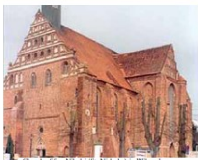
Church of San Nikolai (St. Nicholas) in Wilsnack