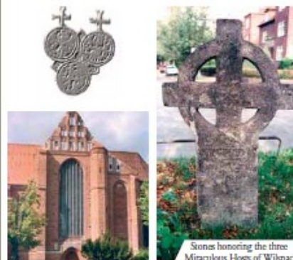
Stones honoring the three Miraculous Hosts of Wilsnack