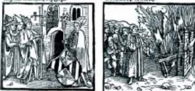
Antique prints depicting the phases of the Miracle