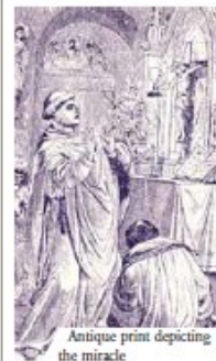
Antique print depicting the miracle