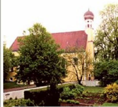
Sanctuary of the Most Precious Blood

A poor peasant of Erding could find no way to improve his economic state, despite working many hours every day. His neighbor on the other hand, who did the same work, succeeded in living prosperously. One day the peasant asked his neighbor how he had succeeded in earning so much and the man confided to him that his success was owed to the fact that he kept the Blessed Sacrament in his house. The poor peasant, ignorant in the faith thought that the Blessed Sacrament was a type of amulet, and decided to imitate his neighbor. He went to Mass on Holy Thursday and after having received Communion, hid the Host in his clothes and left the church with It. During his journey, however, his conscience began to accuse him, so he decided to bring the particle back. During the trip, however, the Host slipped from his hand and