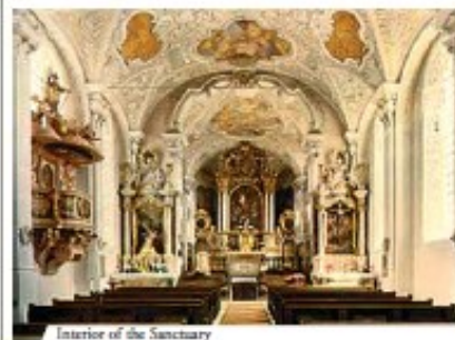
Interior of the Sanctuary