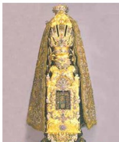
Reliquary containing the Host of the miracle known as Wunderbarlichen Gutes

The Eucharistic Miracle of Augsburg, is known locally as Wunderbarlichen Gutes – “The Miraculous Good”. It is described in numerous books and historical documents that can be consulted in the civic state library of Augsburg. A stolen Host was transformed into bleeding flesh. In the course of the centuries, several analyses were completed of the Holy Piece that have always confirmed that human flesh and blood are present. Today the Convent of the Heilig Kreuz (Holy Cross) is taken care of by the Dominican Fathers.