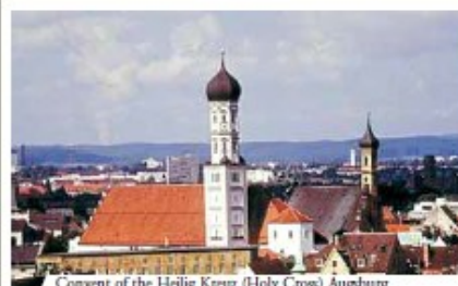
Convent of the Heilig Kreuz (Holy Cross) Augsburg