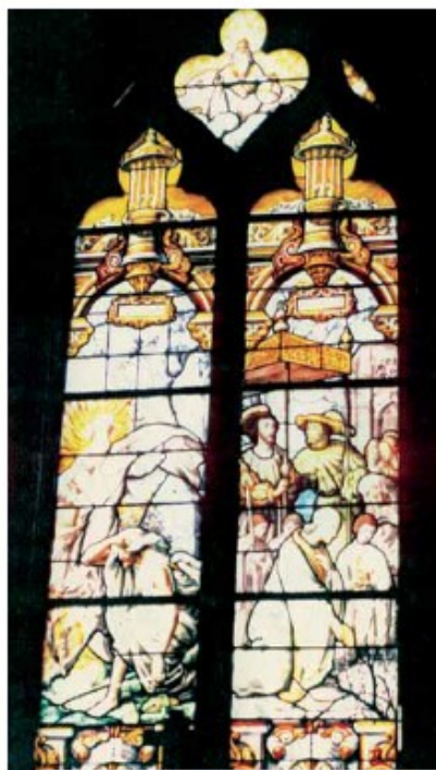
Window depicting the miracle

In 1533, some thieves stole a ciborium containing some consecrated Hosts from a church. The thieves then discarded the Hosts in a field. Unfortunately there was a strong snow storm; however, the following day the Hosts were recovered and miraculously were found to be in perfect condition. The numerous healings and the tremendous popular devotion that followed the miracle were not sufficient to protect the Hosts which were destroyed by some seeking to profane them.