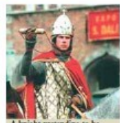
A knight pretending to be the Count of Flanders bringing back the Most Precious Blood