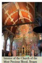
Interior of the Church of the Most Precious Blood, Bruges