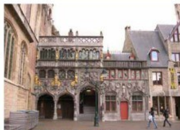
Church of the Most Precious Blood