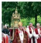
Procession in honor of the Most Precious Blood