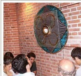
Tabernacle at the Church of Saint Mary where the Hosts of the Miracle are preserved